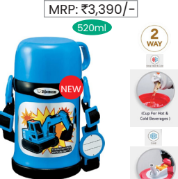
Cyan Blue: SC-ZT45-AZ